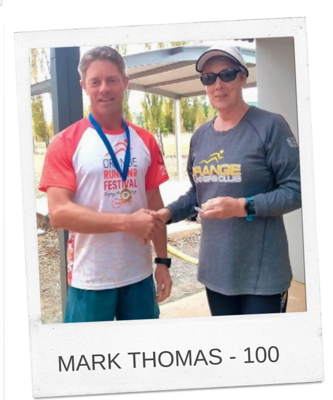
مِن مِن مِن